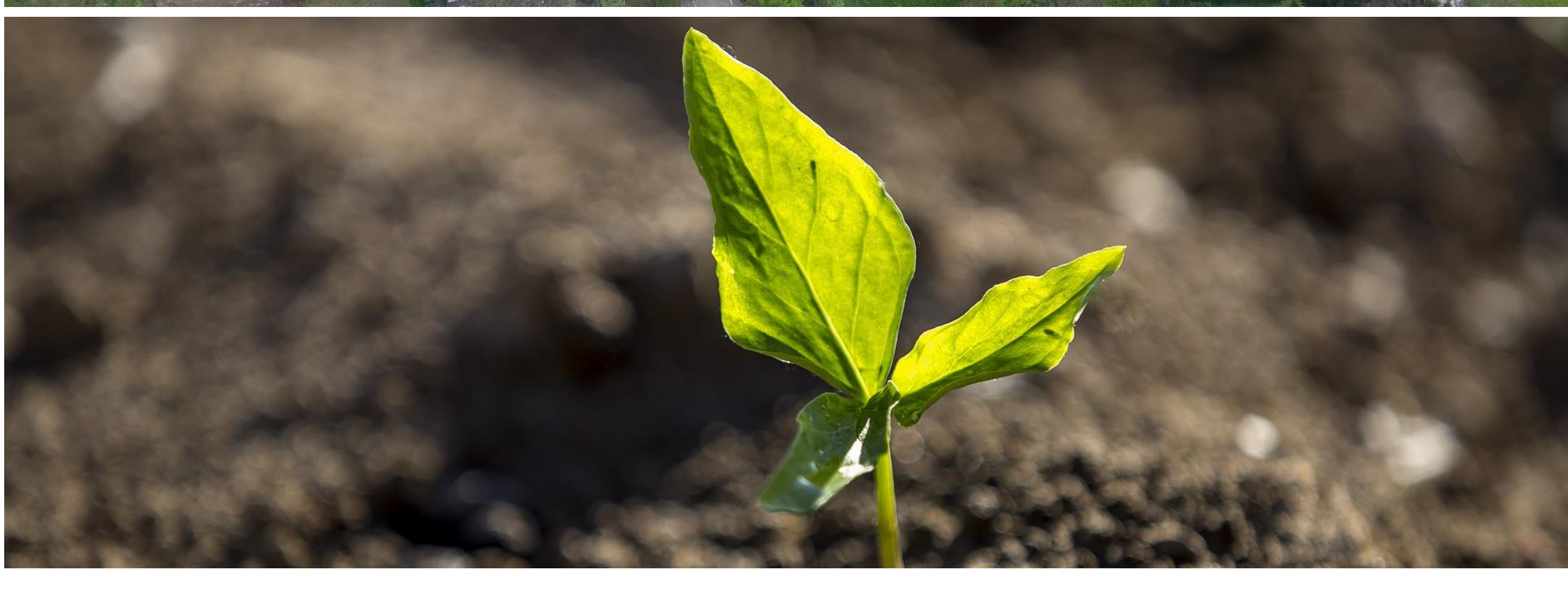
UNIVERSITY OF ZAGREB FACULTY OF AGRICULTURE Adress: Svetošimunska cesta 25, 10000 Zagreb, HR

tel: 01/239 3777 http://www.agr.unizg.hr